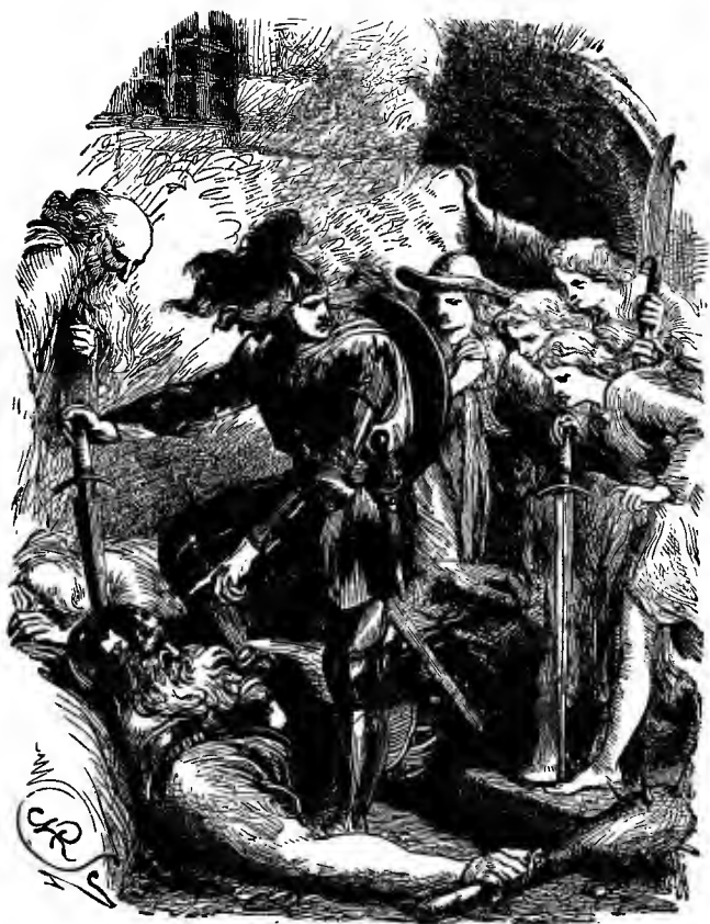
Death of Giant Despair.